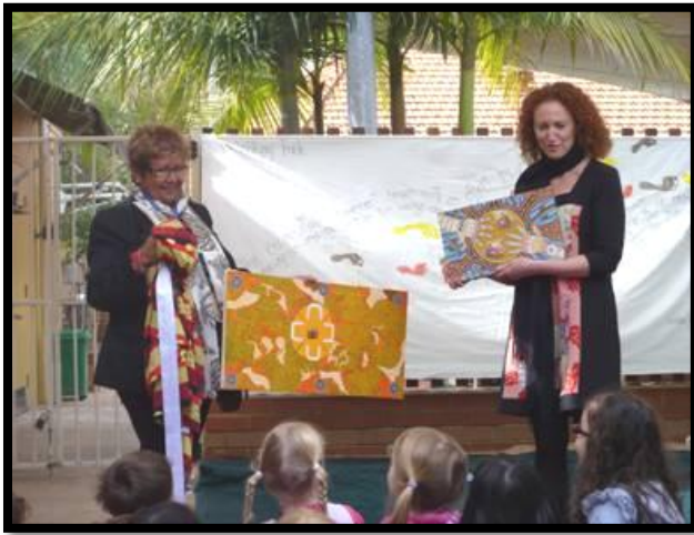
Unveiling the “Walking Track to Reconciliation” to guests from Nura Gili (2011)