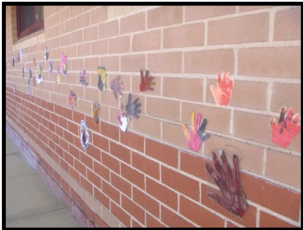
“Sea of Hands” by children, families and visitors from UNSW (2013)